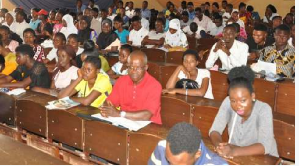
A cross section of students and staff of the School of Science during the 2019 annual conference

Seasoned educationalists and notable educators have called on the federal, state and local governments in Nigeria to increase the annual funds budgeted for education in the country, saying Nigerian education with 6.7% is the least funded in Africa.