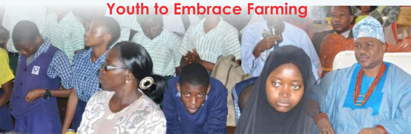
Participants at the 15th CYIAP conference in Nigeria held in the College before the COVID-19 lockdown

Monarch Tasks FG on Agriculture, CYIAP Encourages