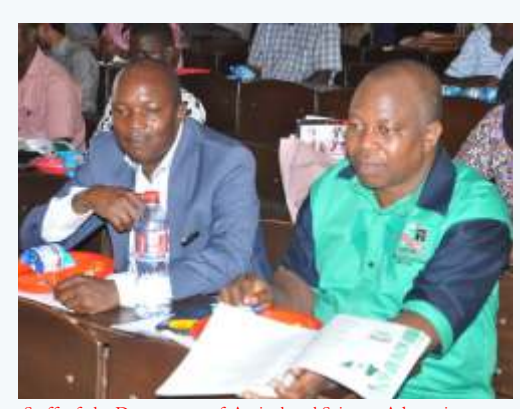
Staff of the Department of Agricultural Science, Adeyemi College of Education