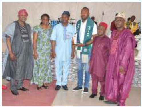
The Provost with one of the awardee and members of the executive