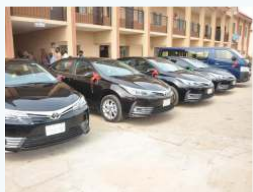
The newly commissioned Toyota Corolla cars and Toyota Hiace bus