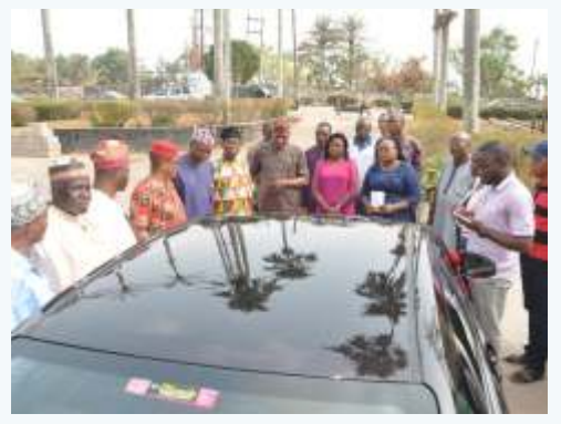
Members of Council and Staff of the Directorate of Information and Public Relations during the inauguration of official vehicles