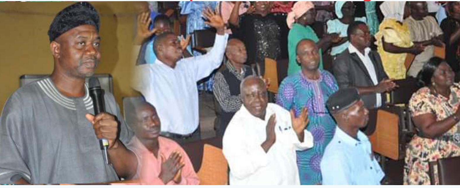
A cross section College community praising God during the March 2020 Monthly Prayer Meeting before the COVID-19 lockdown

Provost Seeks Staff Cooperation to Move College Forward