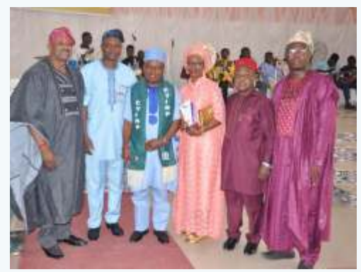
The Provost with one of the awardee and members of the executive of CYIAP network.