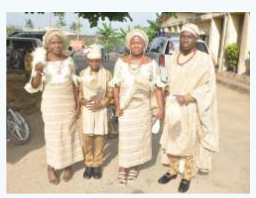
Children of the late Barrister Bashiru Abiodun Yusuf during the funeral