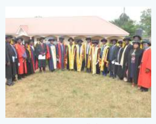
College Management with other staff of the College during the Matriculation Ceremony