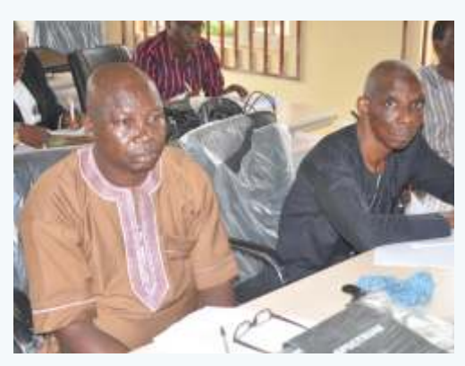
Members of the College Quality Assurance Compliance Team (QACT) during the training.