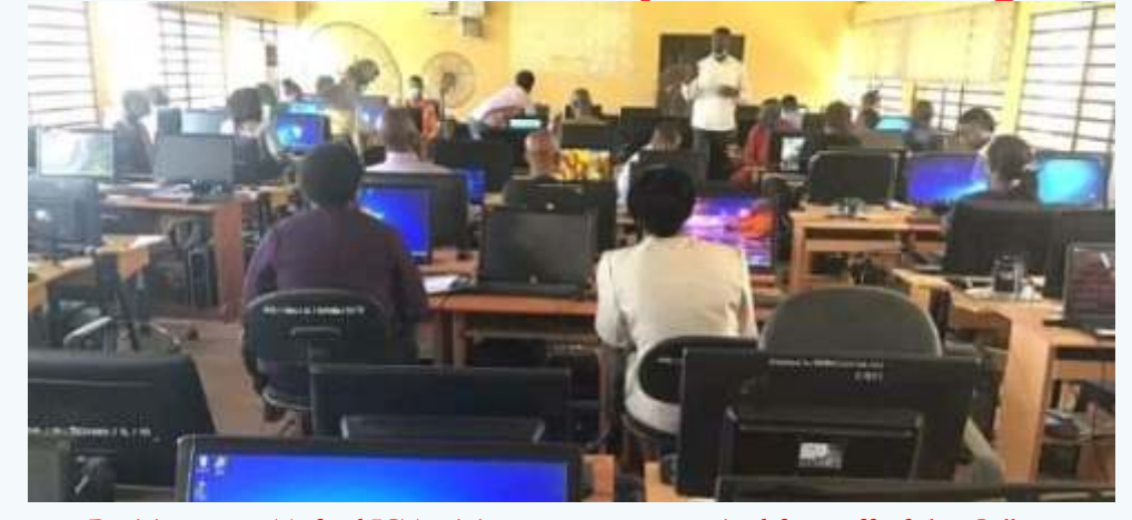
Participants at a Tetfund ICT training programme organized for staff of the College

he Tertiary Education Trust Fund, popularly known as Tetfund, has offered a one-week intensive training to staff of Adeyemi College of Education, Ondo on the use of computer in education, as part of its efforts in staff capacity strengthening in information and communication technology in tertiary institutions across the country.