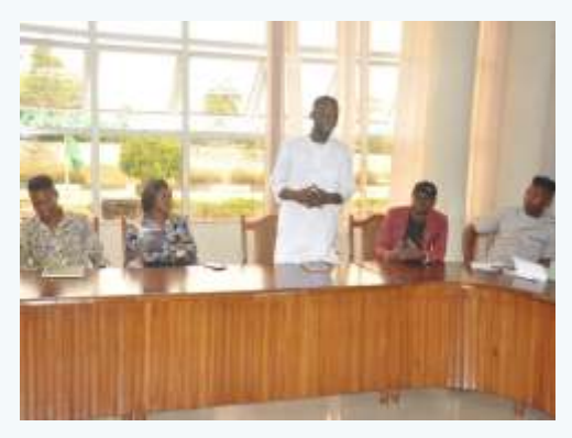
Representative of the Nigerian Youth Parliament addressing the College Management during the Leadership Award presentation to the Provost