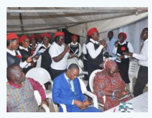
Choir ministering during the funeral for late Barrister Bashiru Abiodun Yusuf