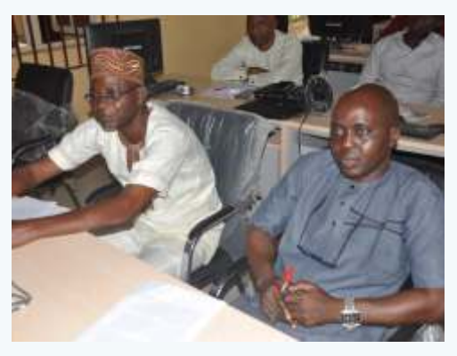
Members of the College Quality Assurance Compliance Team (QACT) during the training.