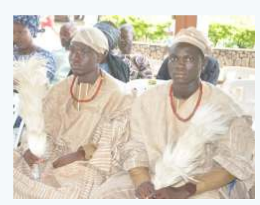
Sons of the late Barrister Bashiru Abiodun Yusuf during the Commendation service held for him in the College