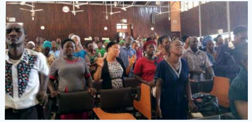
Members of the College community during the new month Prayer Meeting

orkers in Adeyemi College of Education, Ondo have been encouraged to have strong faith in God for greater achievements and brighter days as they look forward to Year 2021.