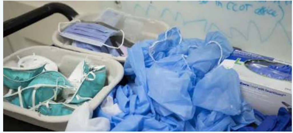
Covid-19: Personal Protective Equipment

s the fight against the dreaded novel corona virus (Covid-19) continues, the executives of Non Academic Staff Union (NASU) Adeyemi College of Education Chapter and the executives of Students' Union (SU) of the College have thrown their weights behind the College Management in the fight against the spread of the virus.