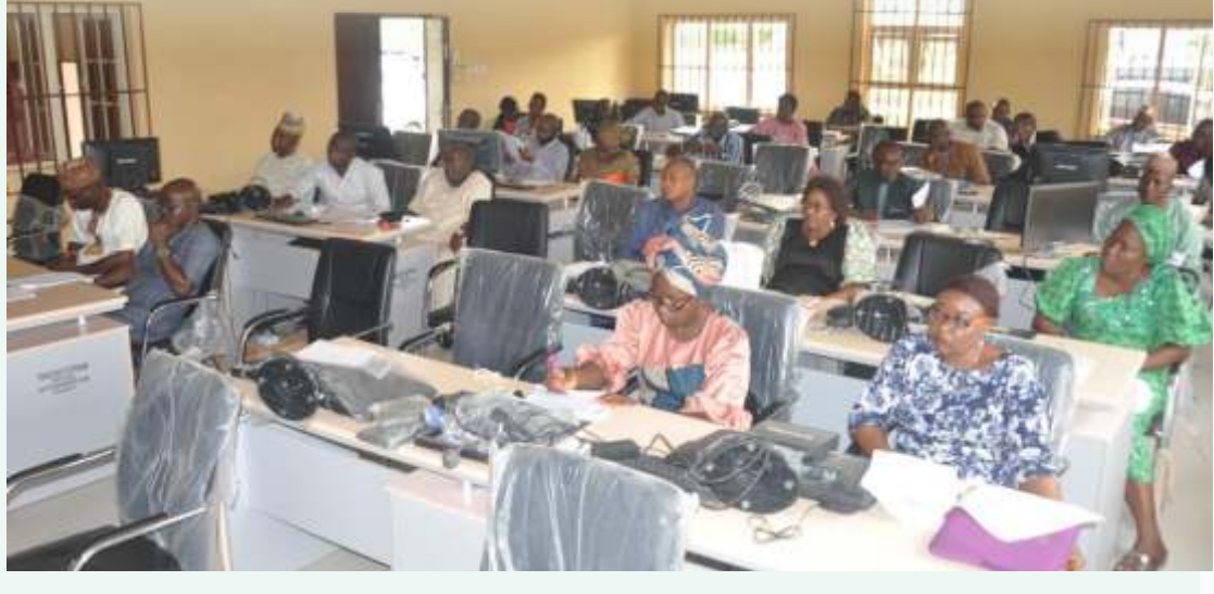
Participants at a sensitization programme organized by the College Quality Assurance Compliant Team (QACT)

he authorities of Adeyemi College of Education, Ondo have inaugurated a Quality Assurance Compliance Team (QACT) as part of the efforts to reposition the institution for global competitiveness and quality assurance.