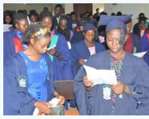
Students during the Matriculation Ceremony