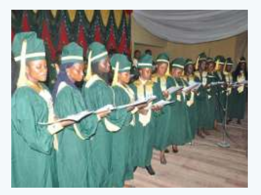
College choir ministering during the Christmas Carol