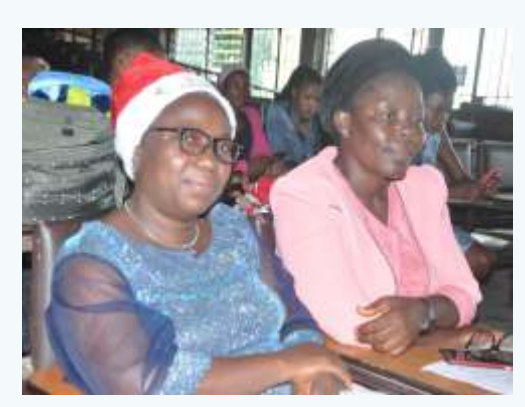
Staff of the College present during the Christmas Carol