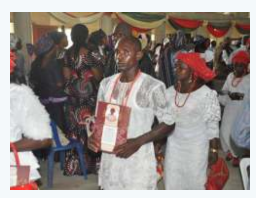
Sibling of Dr Ajigbade Ikuejube during the funeral inside the church