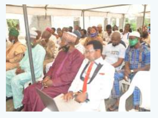
Cross section of participants at the New Year Prayer Meeting held at the College Mosque