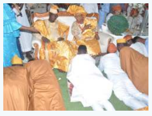
The groom and his friends prostrating to greet his parents