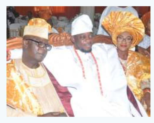
The bride-groom sitting between his parents