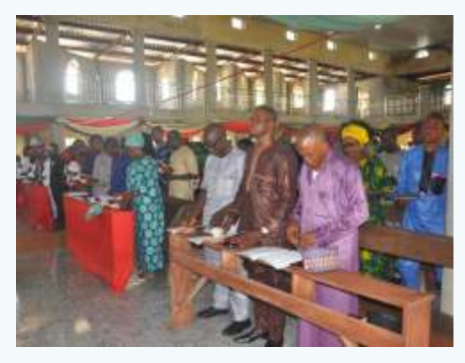
A cross section of the attendees at the funeral inside The Holy Trinity Anglican Cathedral, Igbokoda