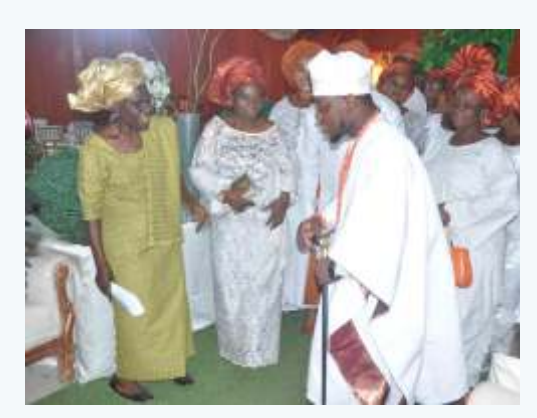
The bride-groom and his relatives