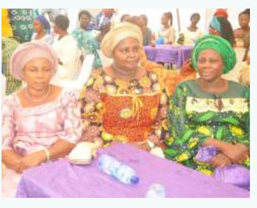
Some Registry staff as guests at the reception