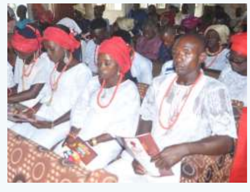
Children of the deceased at the funeral