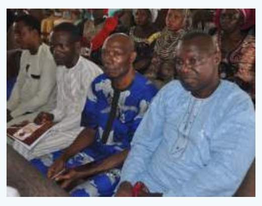
A cross section of dignitaries at the funeral