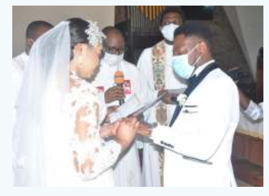
The bride and the groom exchanging marital vows in the presence of officiating ministers