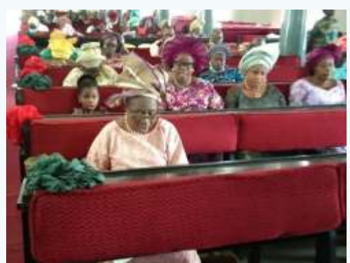
Cross section of participants at the thanksgiving service in honour of late Rev. Canon Olajide Orimogunje