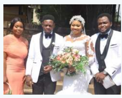
The bride, the groom, the best man and the chief bride's maid