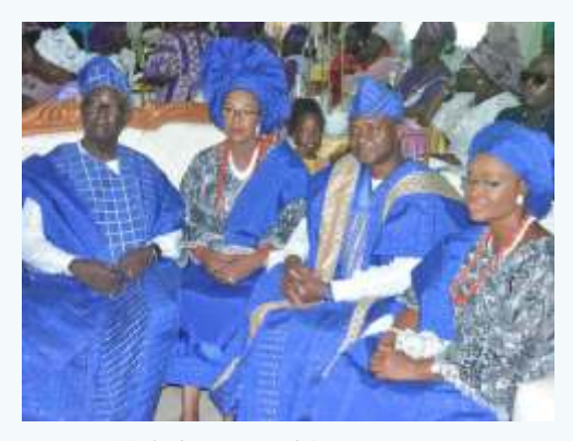
The bride's parents and the groom's parents