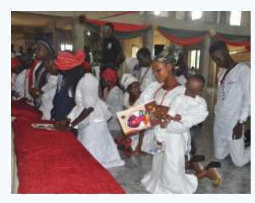
Officiating minister praying for the children of the deceased