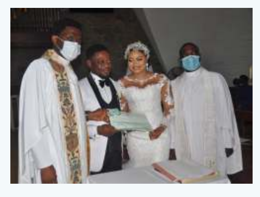
Flanked by the officiating ministers, the new couple displaying their marriage certificate