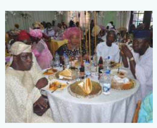
A cross section of deans and directors from Adeyemi College at the wedding reception