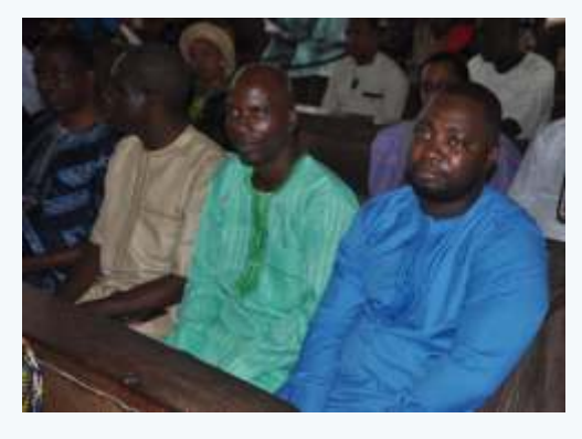
Some staff of Adeyemi College at the funeral