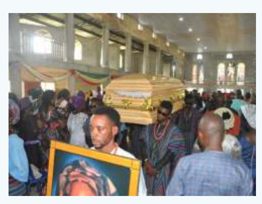
Pall bearers carrying the casket containing the remains of late Madam Ikuejube