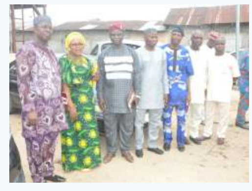
Some College staff as guests at Igbokoda for the funeral