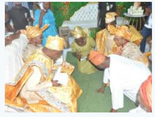
The Akintundes and the family of the bride-groom