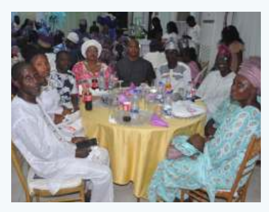
Some staff of the College at the wedding reception