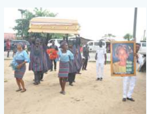
Pall bearers carrying the casket of late Madam Ikuejube