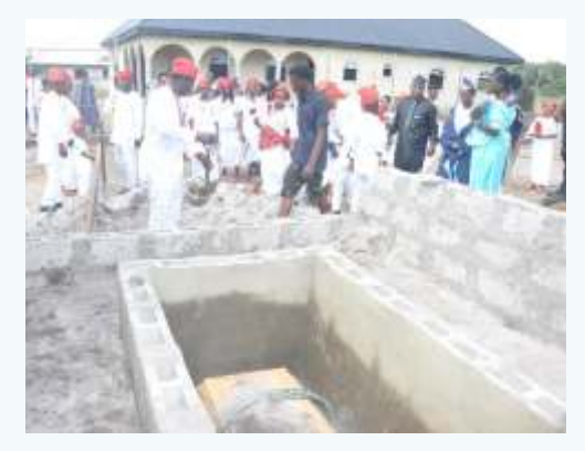
One of the children of the deceased performing the funeral rite