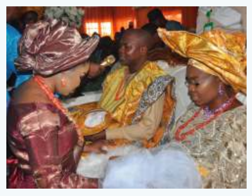
The Akintundes praying for their daughter during the traditional marriage ceremony