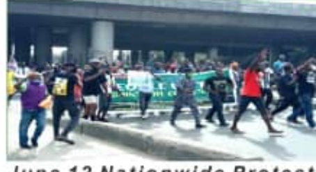
June 12 Nationwide Protest